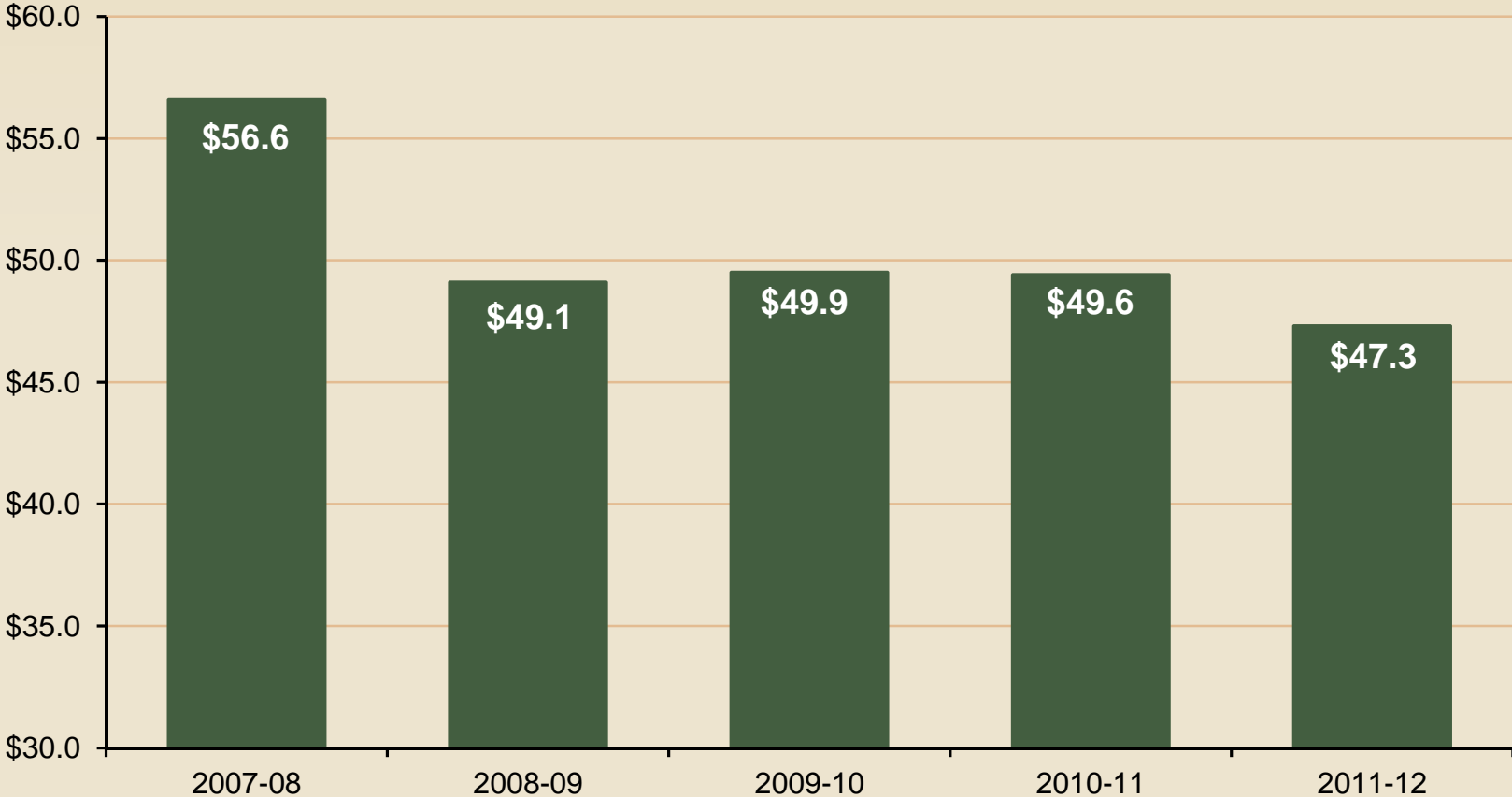
Proposition 98 Funding for K-12 and CCC (Dollars in Billions)