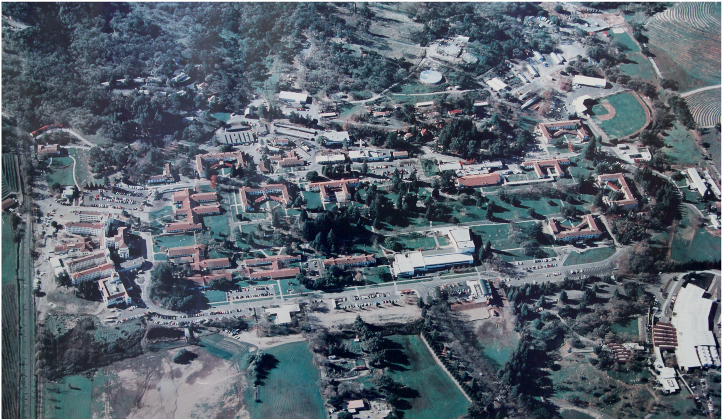
Aerial view of the Yountville Veterans Home Campus