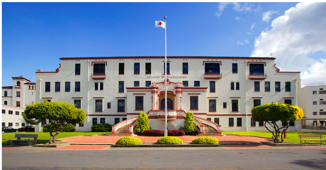
Nelson M. Holderman Memorial Hospital