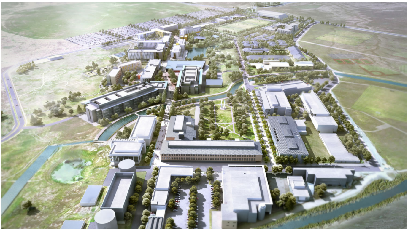
Rendering of Future UC Merced Campus

Public-private partnerships to generate revenue. The Presidio of San Francisco is a 1,500-acre park and former U.S. Army Fort first established in 1776. For decades, the Presidio served as the Army’s premiere west coast installation, but in 1989 it made the federal Base Realignment and Closure Commission’s list of planned closures. The Army left in 1994 and the land was turned over to the National Park Service. 54 Many buildings were unoccupied, infrastructure was in need of significant modernization and landscapes were degraded. Today, thanks to efforts of the Presidio Trust, a board-run federal agency created to save the Presidio, the park has been transformed to showcase the land’s historical roots while repurposing and revitalizing the space to bring in thousands of new residents, hundreds of commercial tenants as well as recreational, hospitality and educational programs. And notably, the trust achieved this reform without taxpayer support – as mandated by Congress – with private financing, generated through partnerships. 55