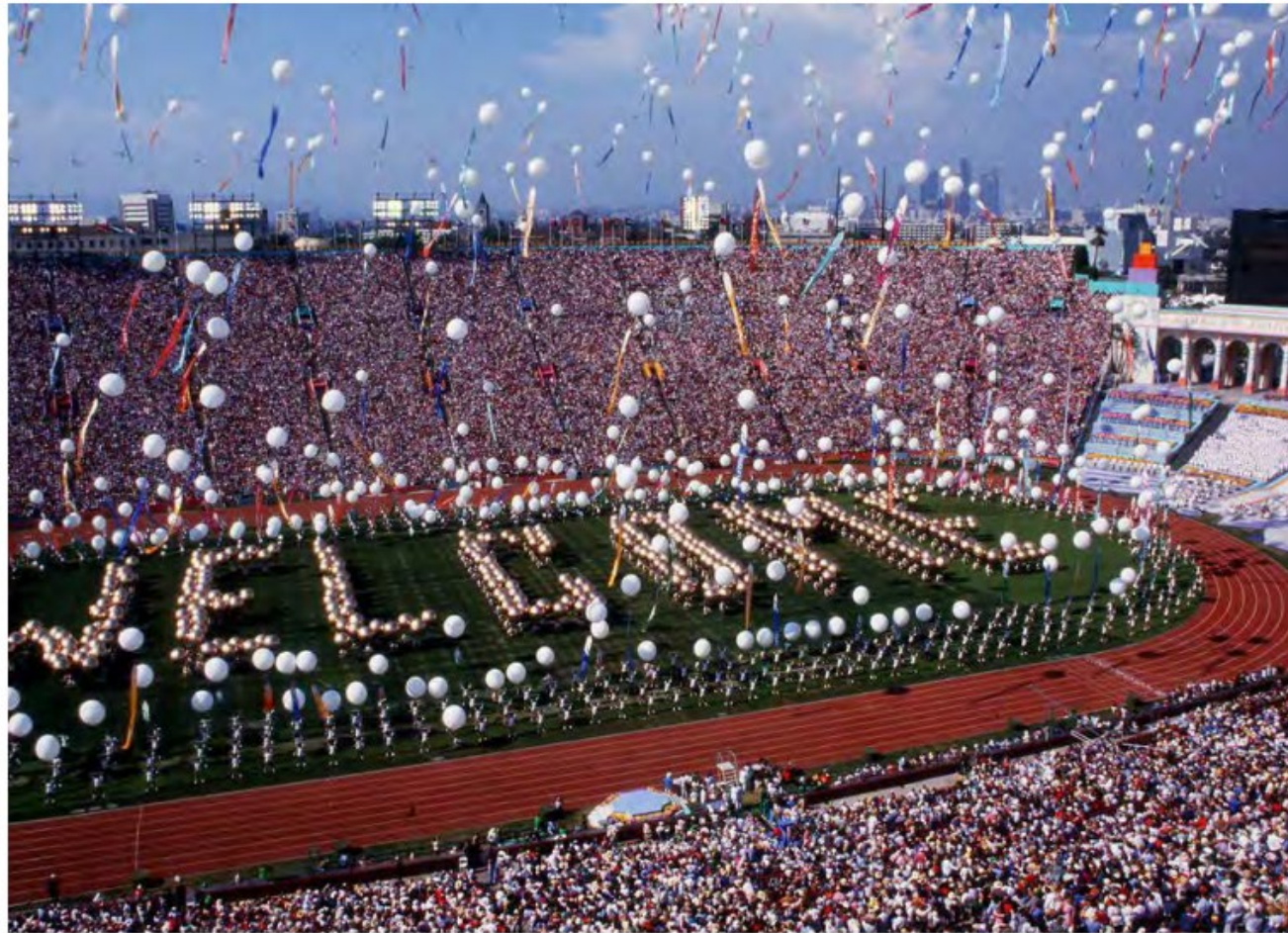
Summer Olympic Games, Los Angeles Memorial Coliseum, 1984

Out of the LA '84 Games, the State invested in Exposition Park and created a new museum and surrounding developments.