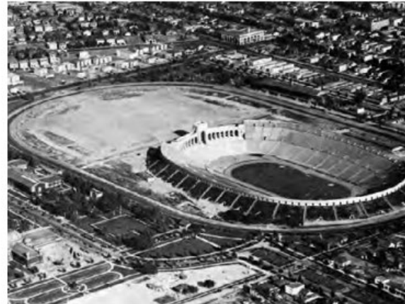
Los Angeles Memorial Coliseum, 1923