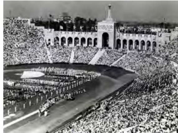
Summer Olympic Games, Los Angeles Memorial Coliseum, 1932