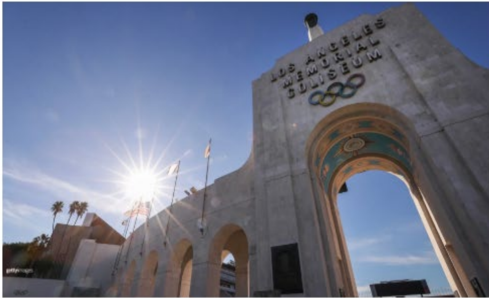
LA MEMORIAL COLISEUM