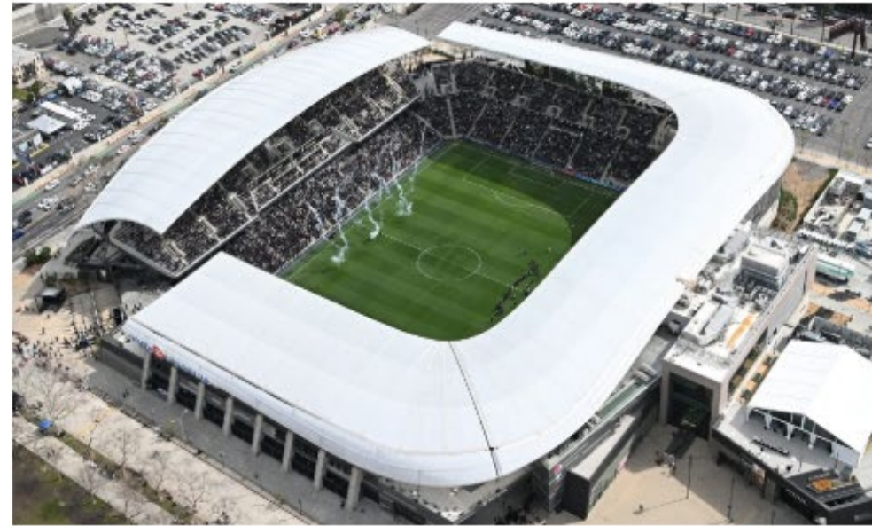
EXPOSITION PARK STADIUM