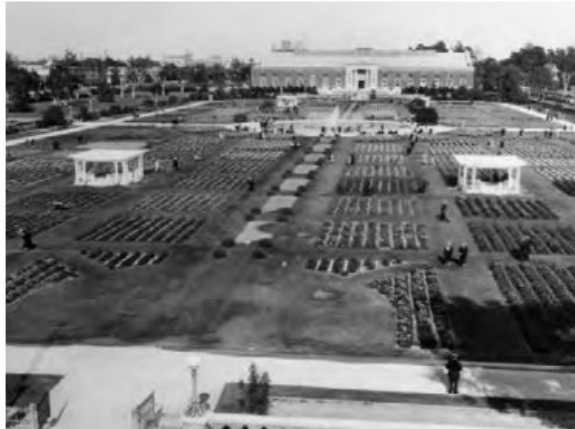
Rose Garden, 1928