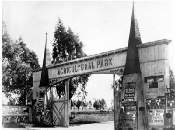
Agricultural Park, 1872